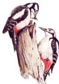
Great Spotted Woodpeckers

For each of these woodland creatures write down as many features as you can that show how it is adapted to the woodland environment. You could think of ways in which other creatures are adapted to their environment.